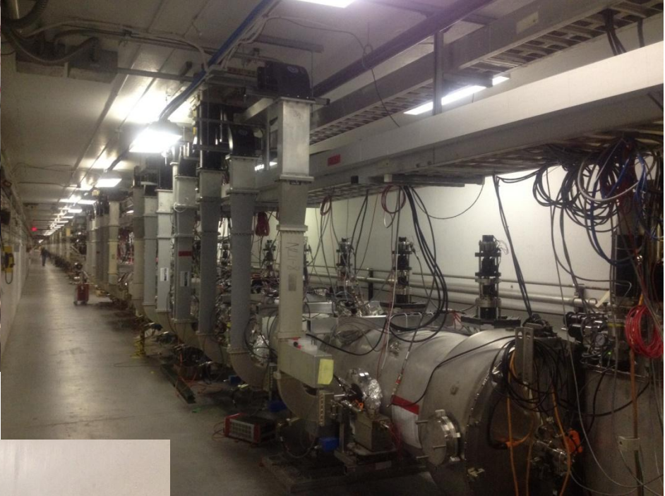
2L22 & 2L23