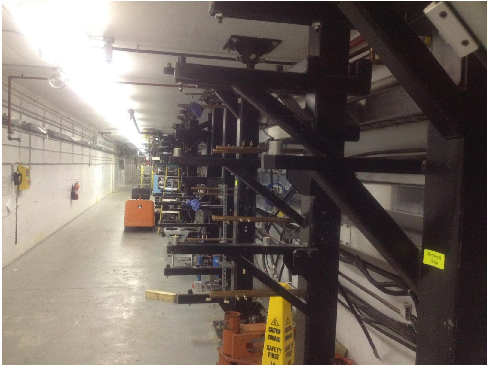
2S on 6/12/12